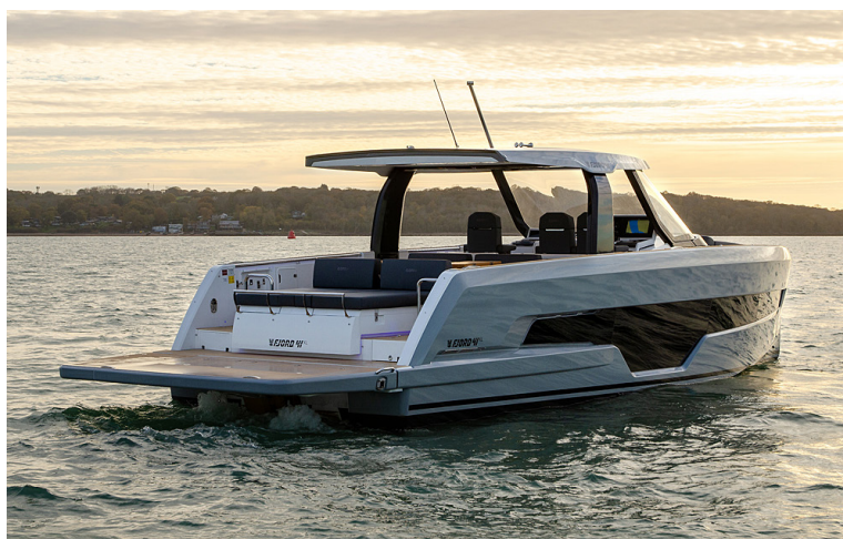
Model year 2025

*All performance figures are given in good faith and are intended as an indication. These figures cannot be guaranteed as top speed in particular is affected by the cleanliness of the hull, conditions of the propellers, weight carried and air/sea temperature. Performance is related also to the optional accessories selected. TBC stands for To Be Confirmed after seatrial. FJORD reserves the right to change specifications in line with the company policy of improvement through research and development. Standard Propeller tested in Greifswald according to Volvo conditions. All measurements/figures approximate. Errors and omissions excepted. Specification and material can be changed without notice. Please check with your dealer for a full list of inclusions. Valid for deliveries until 2025.06.30.